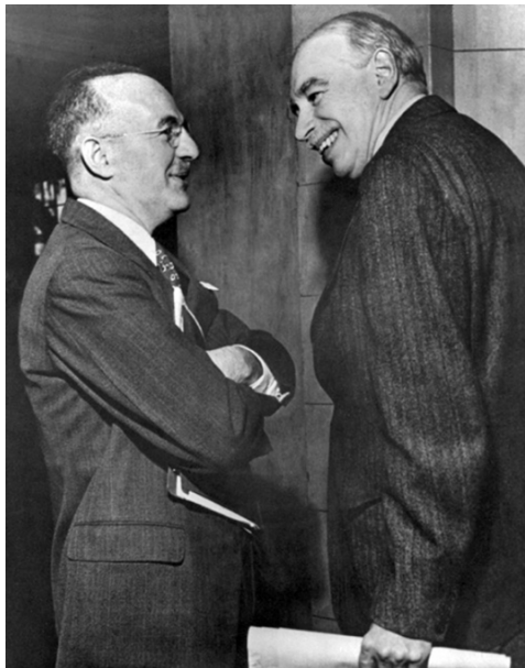
Assistant Secretary, US Treasury, Harry Dexter White (left) and John Maynard Keynes, honorary advisor to the UK Treasury at the inaugural meeting of the International Monetary Fund's Board of Governors in Savannah, Georgia, US, March 8, 1946. 24

Arguably, the greatest innovation of the US, following UK hegemony, was to employ an institutionalised form. The benefit is real or perceived transparent use of power, increased awareness and accommodation of group interests, stability, continuity and a greater probability of belief. Through negotiations in the 1940s a framework was established for the use of power to provide political and economic public goods. The principle negotiators for the US and UK were Harry Dexter White and John Maynard Keynes (pictured below); and whilst their goal was not exclusively security, it was primarily the provision of public goods upon which the GPE could be rebuilt following the end of the Second World War.